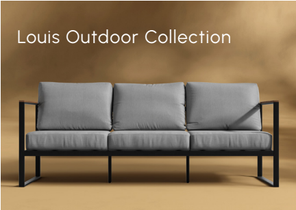
Louis Outdoor Collection