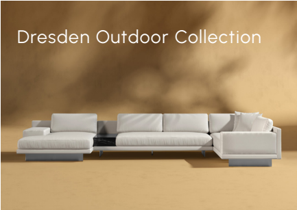
Dresden Outdoor Collection