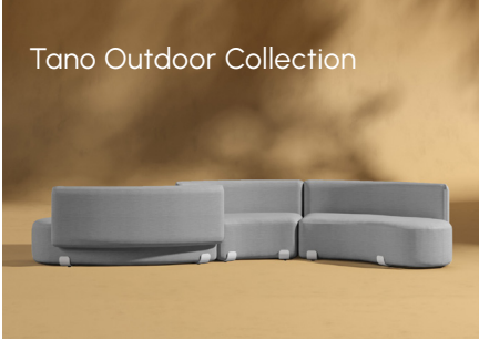
Tano Outdoor Collection