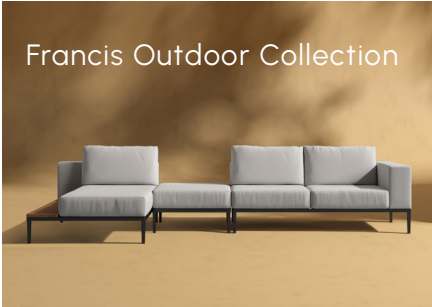
Francis Outdoor Collection