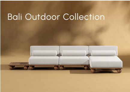
Bali Outdoor Collection