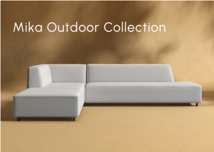
Mika Outdoor Collection