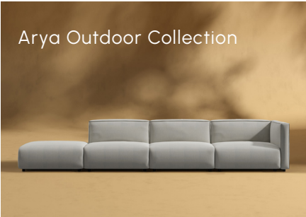
Arya Outdoor Collection